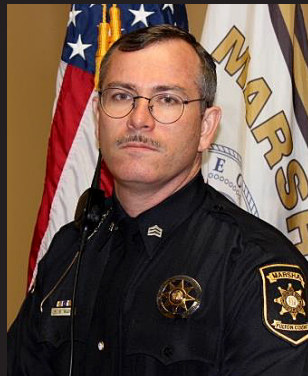
Sergeant Buck promoted to Lieutenant