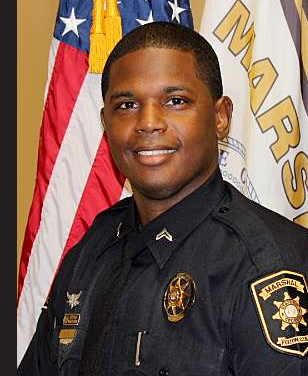
Corporal Hill promoted to Sergeant