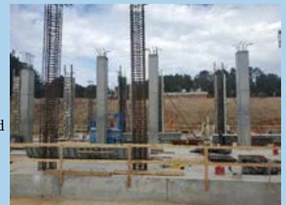
MBR DeOx Walls Columns