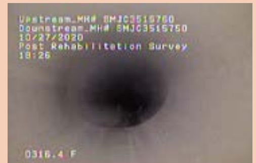
After-new seamless, structural repair, completed without digging