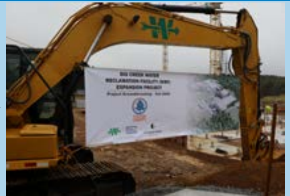
Groundbreaking Ceremony 11/12/2020

Located in Roswell, Georgia and within the Big Creek watershed, the facility serves the Cities of Roswell, Alpharetta, portions of Milton, Johns Creek, and Sandy Springs in addition to small areas of Cobb, Forsyth, and DeKalb Counties. The joint venture will utilize progressive design-build to expand the 50-year-old facility’s treatment capacity from 24 to 32 million gallons per day to meet the projected wastewater treatment demands from future growth through at least 2050. The expansion will result in reduced light, noise and odor emissions, with the new treatment process producing cleaner water than the existing plant, along with reduced discharges to the river, even at the higher flow capacity. For more information on the project, please visit www.bigcreekexpansion.com .