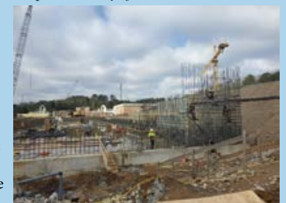
Dewatering Building