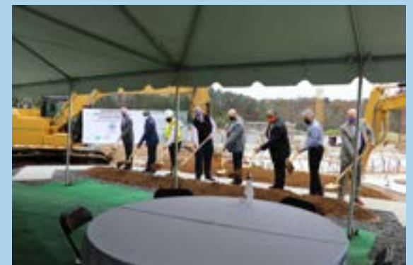
Groundbreaking Ceremony 11/12/2020