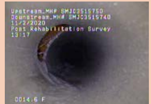
After-trenchless, no digging reinstatement of service lateral via robotic cutter