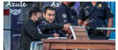
Our Police need help