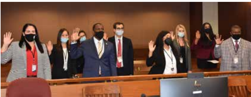
5/21/2021 Our new ADA's and Investigator's swearing in.