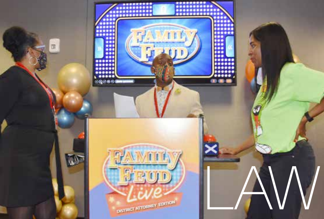
On May 6, 2021, we celebrated Law Day...Family Feud Style! Questions were centered around law, which also promoted team building.