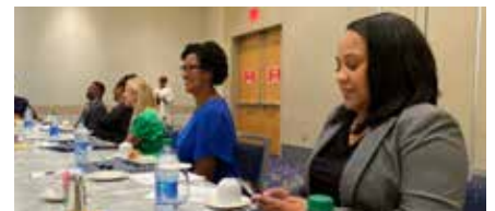
Human Trafficking Roundtable