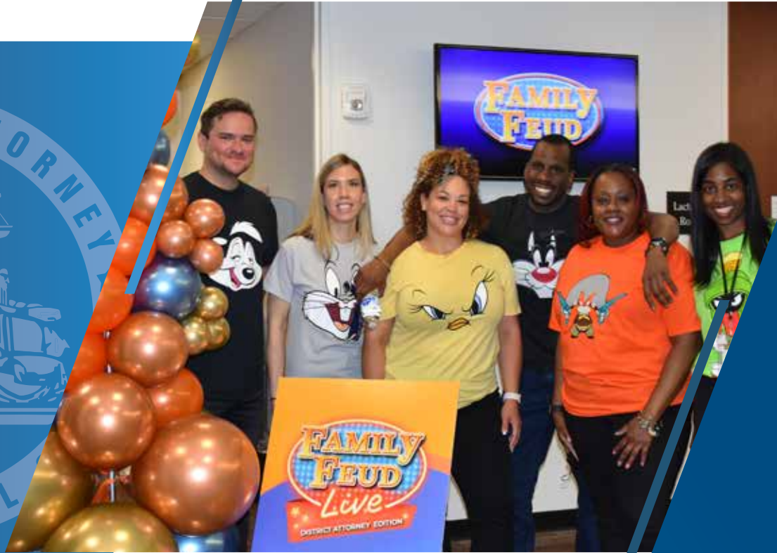
The Fulton County District Attorney's Office