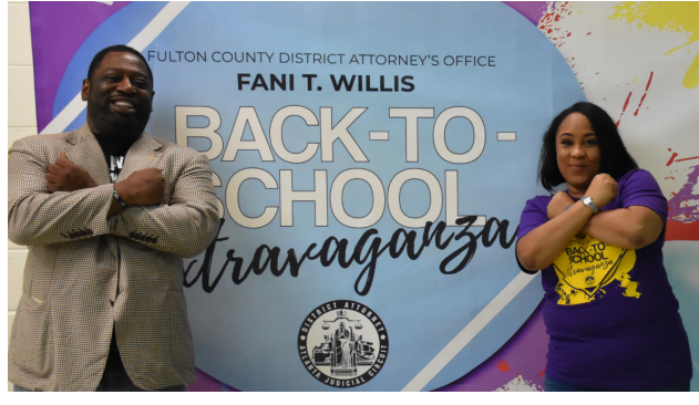
Fulton County Commissioner Marvin Arrington, Jr. comes to support Bookbag Extravaganza at South Fulton location.