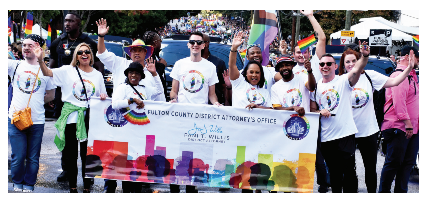
Members of the Fulton County District Attorney's Office participate in the Atlanta Pride Parade in support of the LGBTQ+ community.