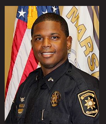
Corporal Hill promoted to Sergeant