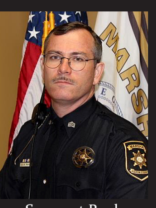
Sergeant Buck promoted to Lieutenant