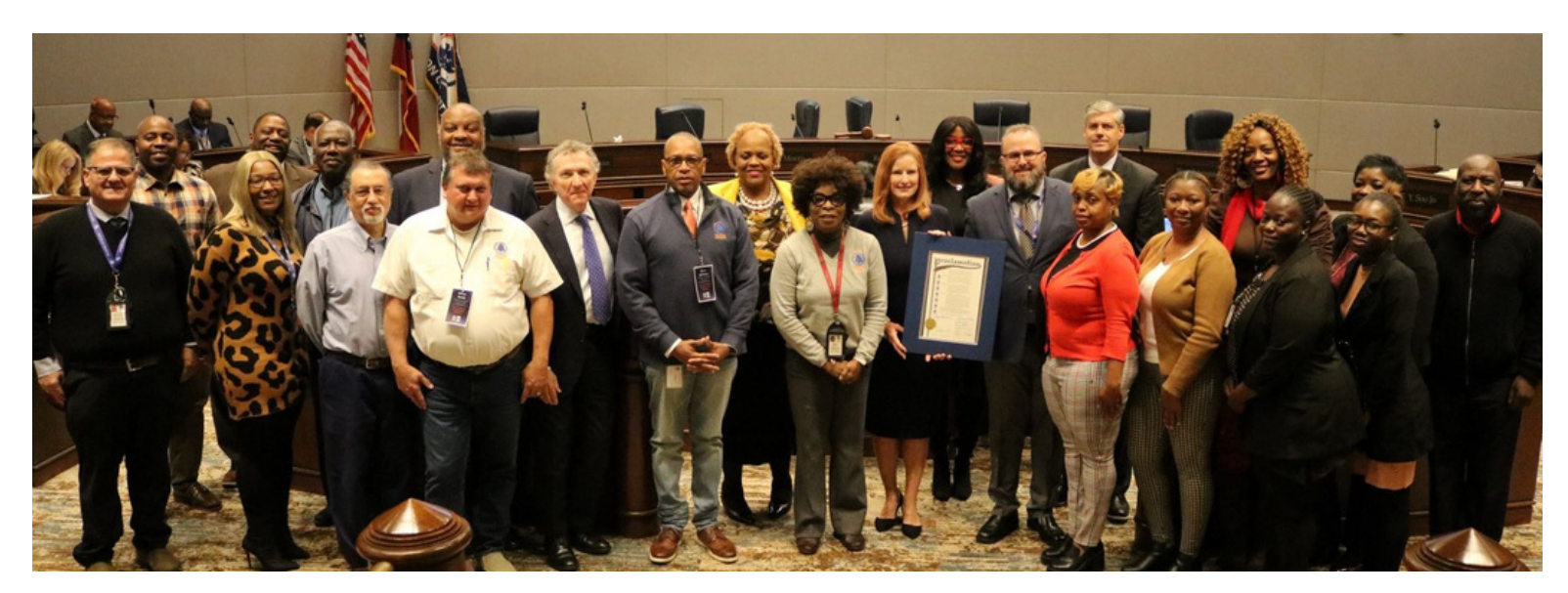
Public Works employees receive a proclamation from the Board of Commissioners in honor of Clean Water Week

Recently we celebrated another Clean Water Week, as was mentioned during the Proclamation Ceremony with the Board of Commissioners, I am very grateful that I work with a large number of staff that treat every day as Clean Water Week. While it is nice to be recognized for what we do, truth be told the number of activities that all of Public Works complete on a daily basis improves the daily lives of everyone in Fulton County – whether they recognize it or not. So before we all get too busy with the holidays, thank you all for making Public Works such a great department and for always being willing to do whatever is needed to be done for the County and its residents.