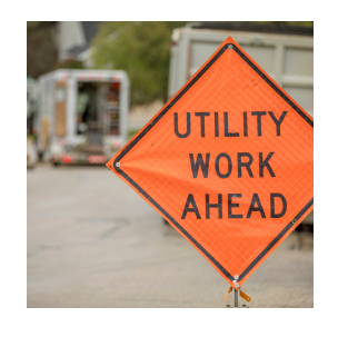
Understanding Utility Easements in Fulton County Page 5