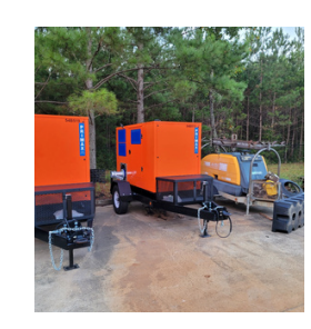
New Bypass Pumps Help Prevent Service Interruptions Page 6