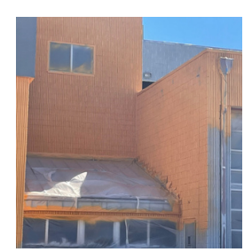
Renovations Underway at Fulton County Executive Airport Page 6