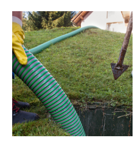
Fulton County Residents learn to be Septic Smart Page 4