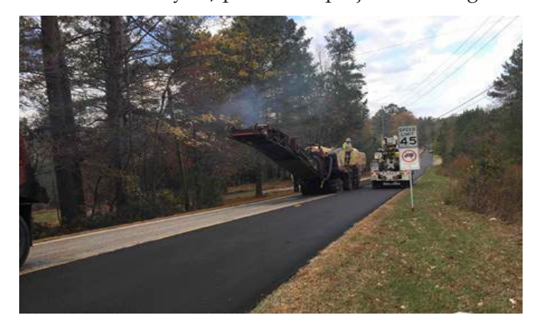
Resurfacing Fulton County roads Fall 2017