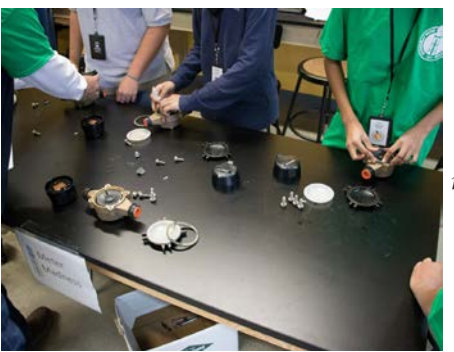
Students practice assembling water meters with the Meter Madness activity