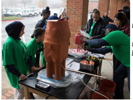
Volunteers test a model water tower at the Dimensions station