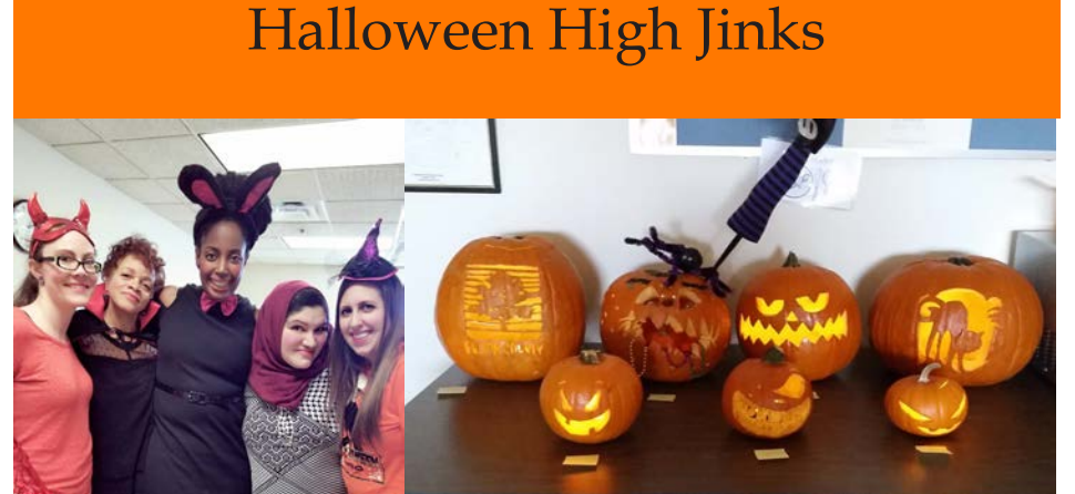
Lab employees celebrated the holiday with a costume party and pumpkin carving contest!