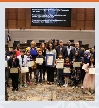
Fulton County Honors the 2023 Art Calendar Winners

Consumption Behavior in Water Distribution