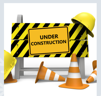
Commercial Pretreatment Program Overhauled