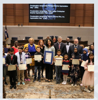
Fulton County Honors the 2023 Art Calendar Winners