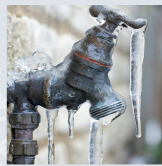
Preparing your home for the Winter Season